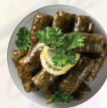
Beef minced on grape leaf

(* We will add $1 more for rice paper wrap. You can only choose 2 proteins