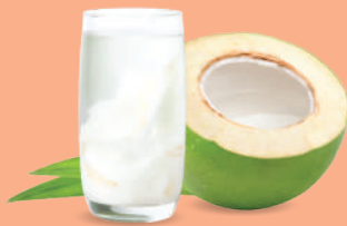
Coconut Juice $xx