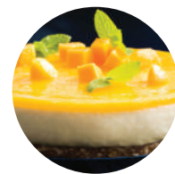
Mango Mousse $xx