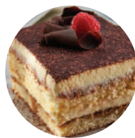
Tiramisu Cake $xx