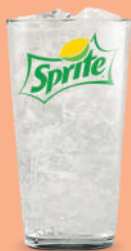
Soda (Coke, Sprite and Fanta) $xx