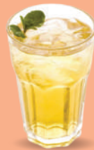
Ice Tead $xx