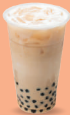
Thai Tea $xx