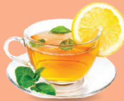
Hot Tea $xx